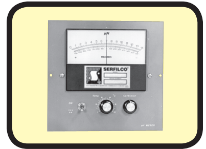
MODEL 111 pH MONITOR

MODEL 111 MONITOR is identical in function to Model 434, but is designed for panel mount. The same reliable monitor is used where weather resistant feature is not needed.