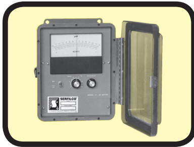
MODEL 434 pH MONITOR

MODEL 434 MONITOR has the same reliable circuitry found in our laboratory instruments. Its NEMA4X case provides excellent corrosion-proof and chemical resistant protection.